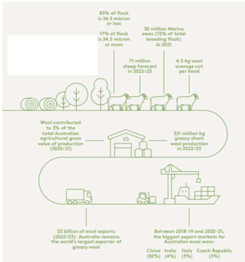
Figure 2 Australian Wool Domestic Supply Chain 2022 6

The Australian wool industry contributed 3% of the total Australian agricultural gross value of production in 2020-21, which is additional to the 8% that the lamb and mutton industries contributed.